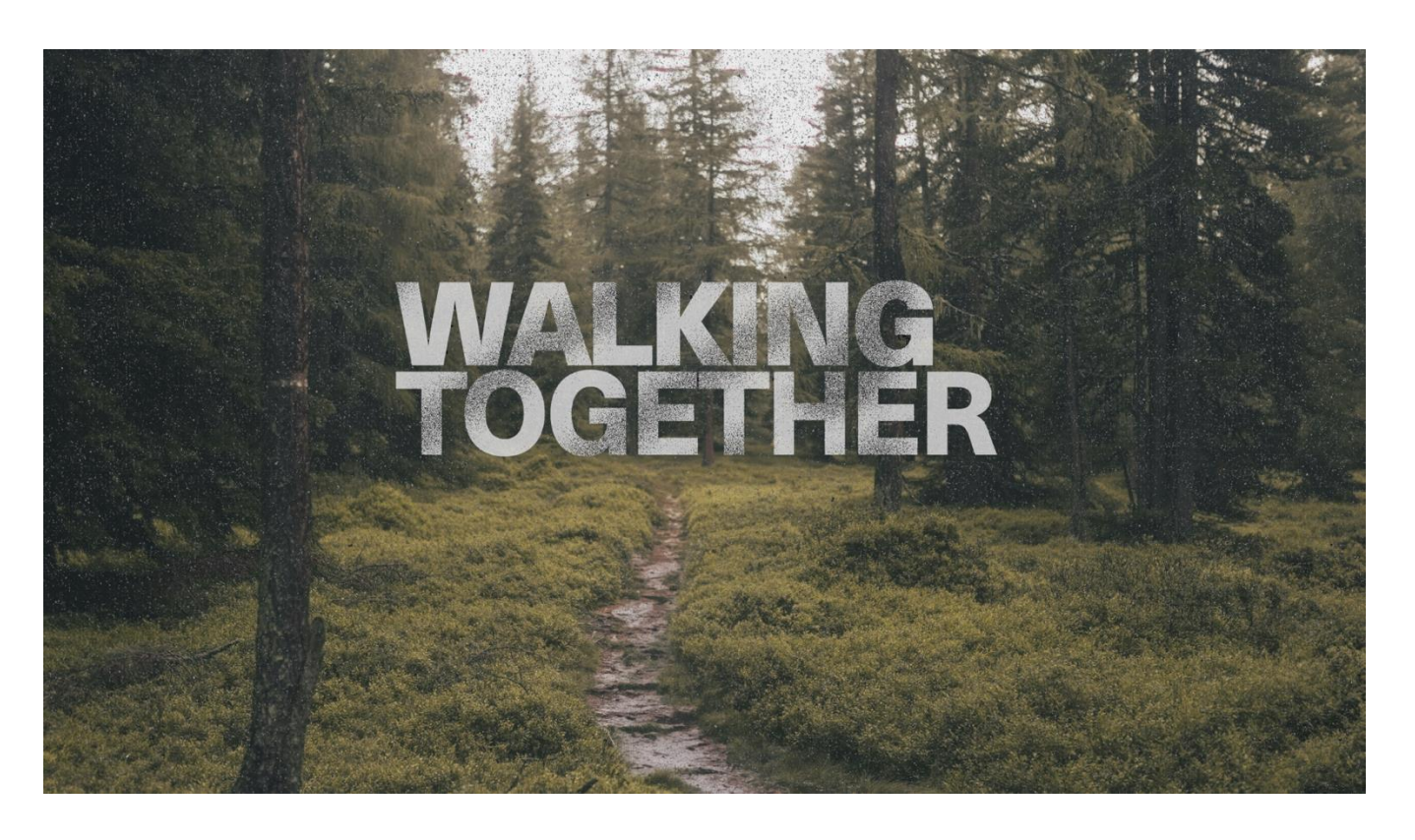
<u>Jesus with Non-Christians (Colossians 4:2-6) – Walking Together</u> June 23, 2024